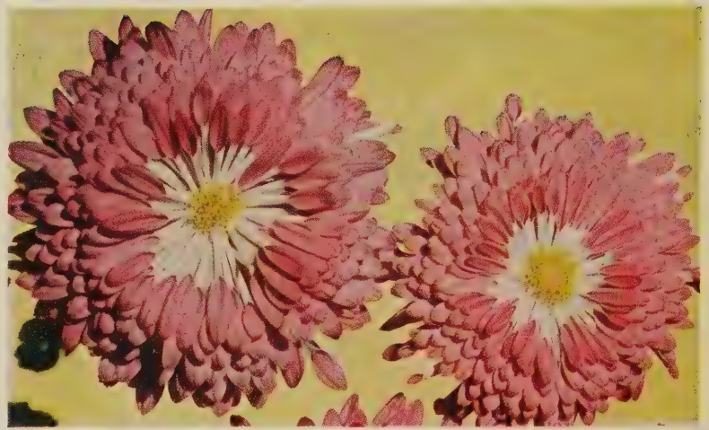
MAGENTA SPOON. 60c each; 3 for $1.50